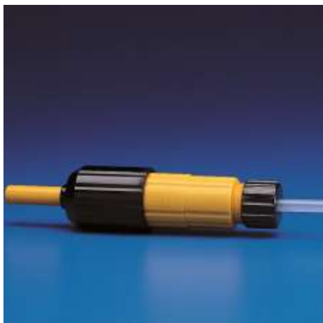
НАПОЛНИТЕЛЬ ПИПЕТКИ С ПЛУНЖЕРОМ