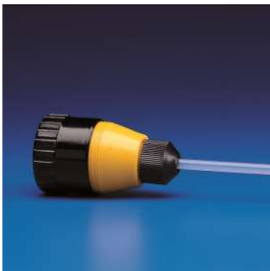
ВАКУУМНЫЙ ПИПЕТАТЕЛЬ «VADOSA»